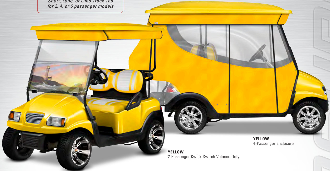
YELLOW 2-Passenger Kwick-Switch Valance Only

Requires a DoubleTake® Short, Long, or Limo Track Top for 2, 4, or 6 passenger models